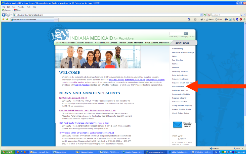
Quick Link to OPR Providers web page on indianamedicaid.com

Providers may verify IHCP enrollment by using the OPR Provider Search function on indianamedicaid.com. Refer to the OPR Provider quick link and select the OPR Provider Search option.