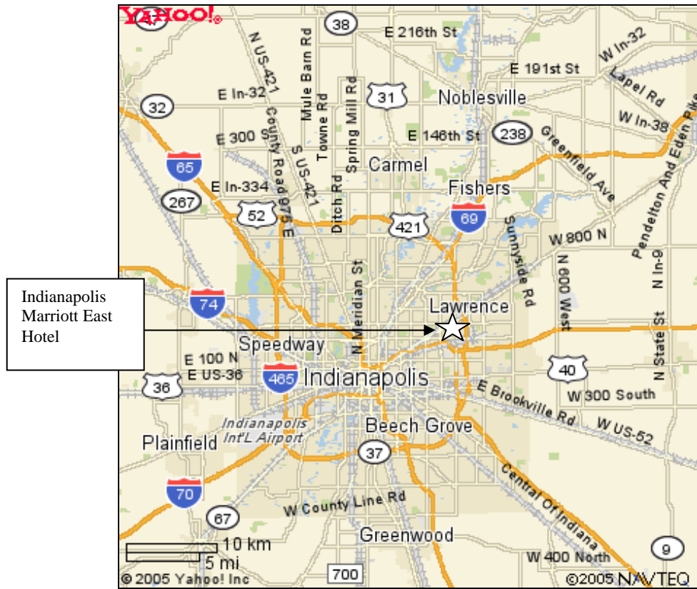
Figure 1 – Indianapolis Map Showing Location of Indianapolis Marriott East Hotel