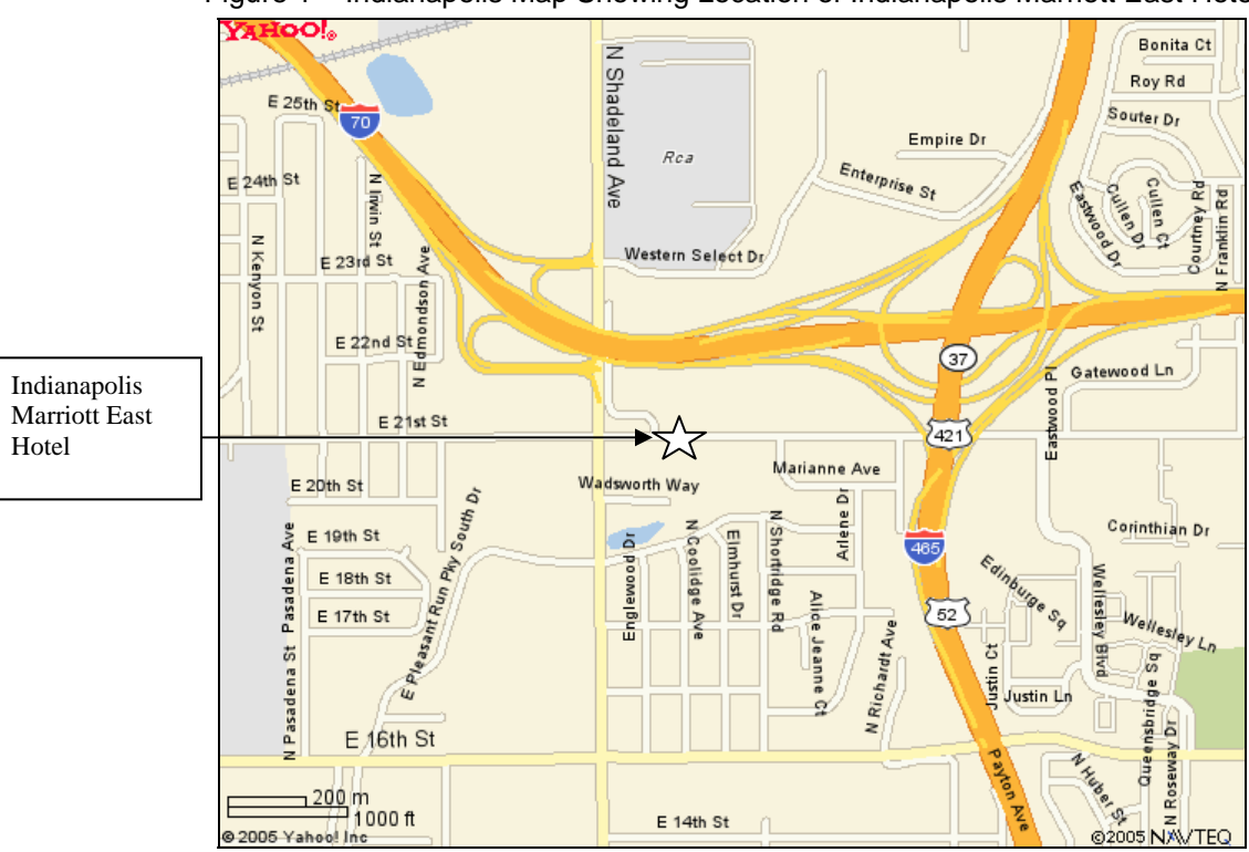
Figure 2 – Map of Specific Location of Indianapolis Marriott East Hotel