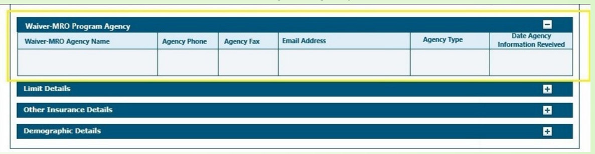
Table 1 – Waiver-MRO Program Agency information on the Portal