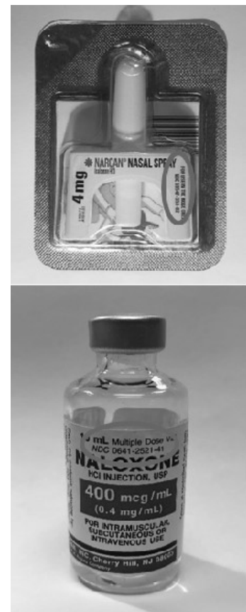
Figure 1 – NDC on nasal spray and liquid vial of naloxone