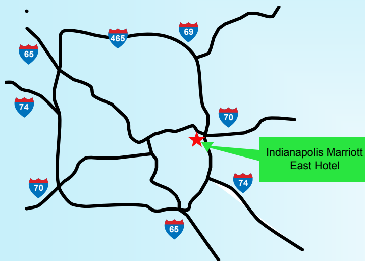
Indianapolis map showing location of Indianapolis Marriott East Hotel