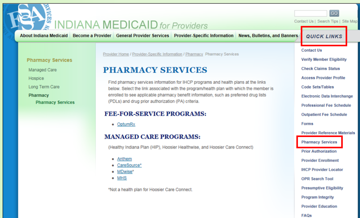
Figure 1: Pharmacy Services Quick Link displays links to FFS and managed care pharmacy benefit information

The Indiana Healthcare Coverage Programs (IHCP) updated the Pharmacy Services Quick Link at indianamedicaid.com to include hyperlinks to pharmacy information for each of the managed care entities (MCEs). Providers can now more readily access the preferred drug lists (PDLs), prior authorization (PA) criteria, and other pharmacy benefit information for Healthy Indiana Plan (HIP), Hoosier Care Connect, and Hoosier Healthwise (HHW) members. A link to OptumRx continues to be available for pharmacy benefit information for fee-for service (FFS) members. The Quick Links navigation panel, shown in Figure 1, appears in the provider website banner for easy access.